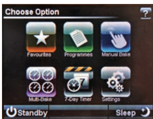
User-friendly color touch controller.