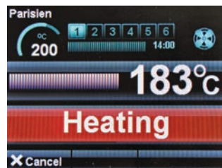
The heating screen shows the temperature progress.