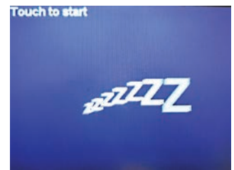
Putting the oven into sleep mode between bakes help save energy.