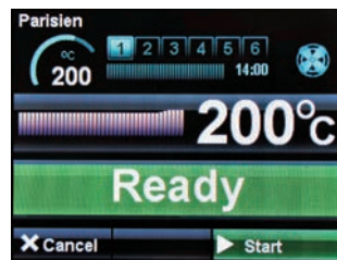
When the oven reaches the correct temperature the ready screen will show.