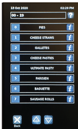
Able to store up to 240 unique baking programmes.