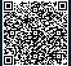
Scan using your smart phone to view the Static Rack on our website.

To find out more contact us directly or check out our website.