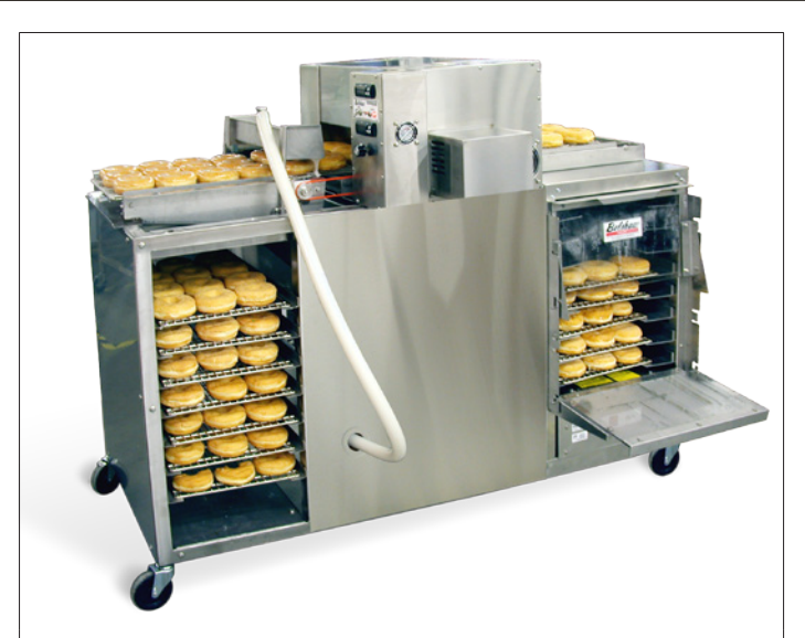
Thermoglaze TG25. 8-shelf Thermolizer is shown at right (with door open). Storage shelves are shown at left.