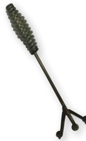
Doughnut Tray Tool