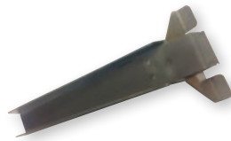
Doughnut Tray Handles