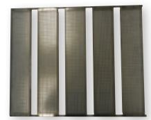
Tabletop Doughnut Fryer Tray