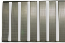
Aztec Doughnut Fryer Tray

To complement our Doughnut Fryers and Jammers, MONO Equipment also supplies a comprehensive range of accessories for these machines.