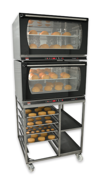
Optional Extras and Configurations Racked Base Unit for Compact 643 and Compact 644

Please contact MONO Equipment for USA electrical details.