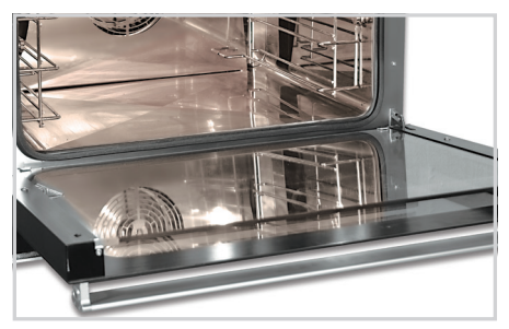
Twin pane vented glass reduces external door temperature