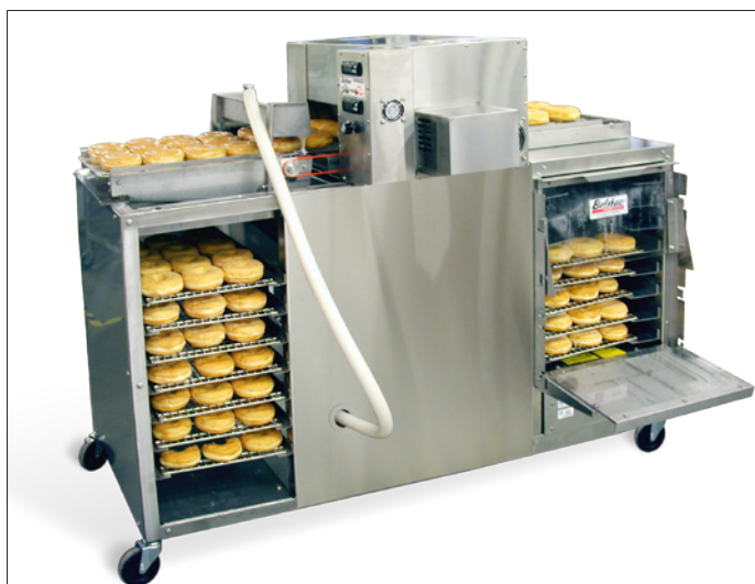
Thermoglaze TG25. 8-shelf Thermolizer is shown at right (with door open). Storage shelves are shown at left.