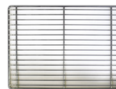
12.5" x 17" Screen for TG25