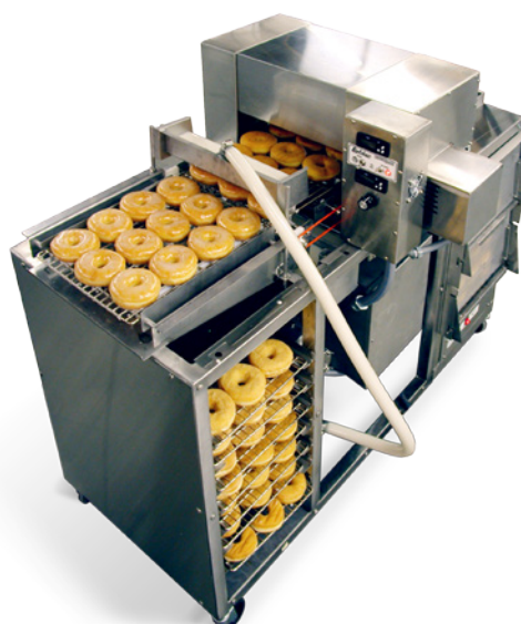
TG25 top view