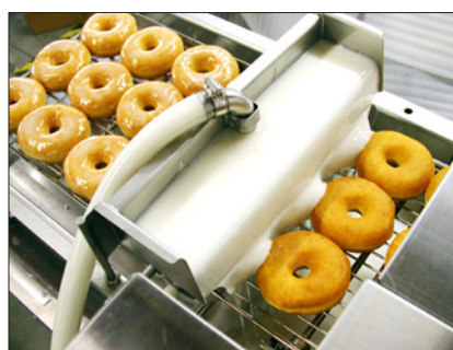
TG25 glazing donuts