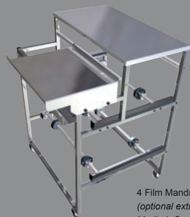
4 Film Mandrel (optional extra for Merlin L-Sealer)