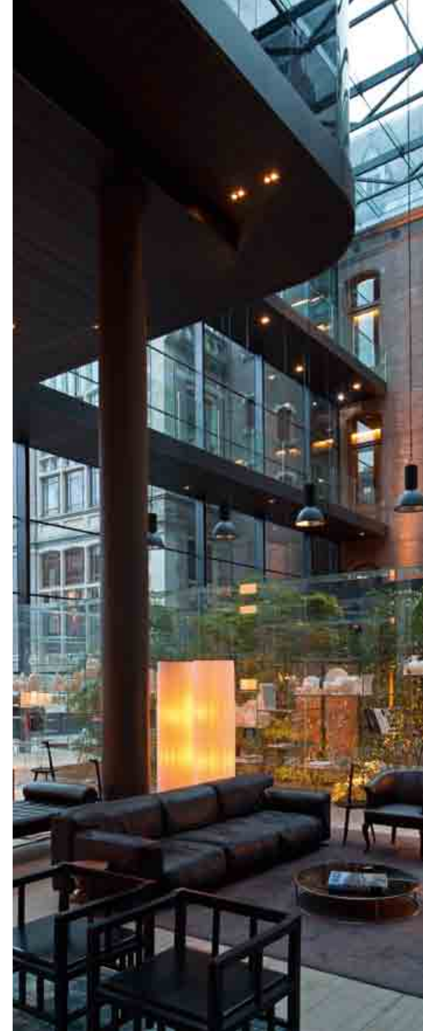
View of the elegant, spacious lobby lounge. Tunes restaurant, home of star chef Schilo van Coevorden.

"Curious diners can watch Schilo van Coevorden and his team prepare nine-course seasonal tasting menus directly from the dining room, which is divided from the kitchen by a large glass wall"