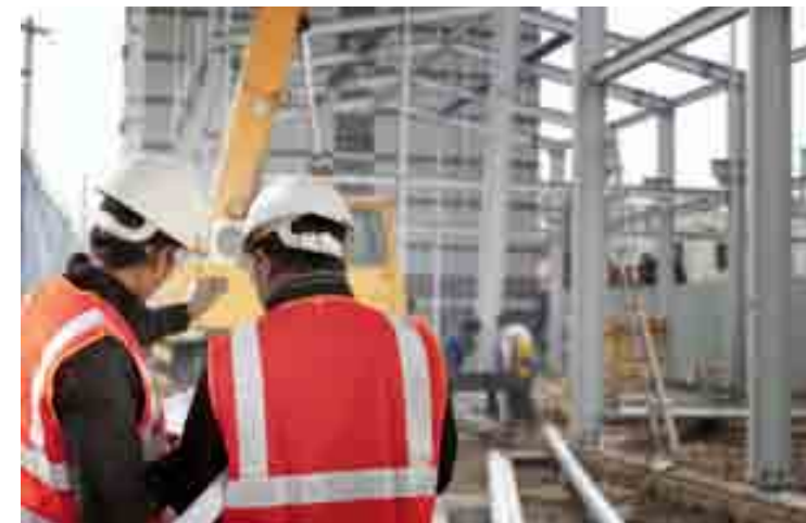
Engineers working on a construction site.

I arrive, there is nothing in the area, just vacant land. Sometimes I encounter an area destroyed by war and I am proud to be there, to advise and quickly deliver a kitchen that will be an important part of starting over.