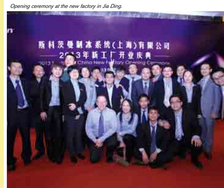
Opening ceremony at the new factory in Jia Ding.