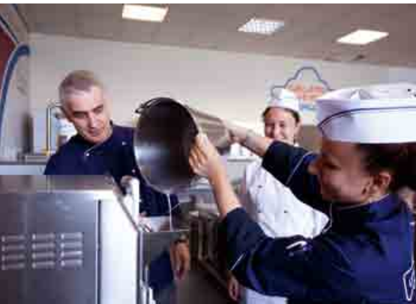
The lessons at Gelato University are both theoretical and practical.

More and more people and investors are being drawn to this sector, especially outside of Italy, where the opportunities for growth are the highest. The school's headquarters are in Anzola dell'Emilia, Bologna, and courses are held on 12 other campuses located throughout the world. This year Carpigiani University will be bringing artisanal gelato to Spain, the Middle East, Southeast Asia and North and South America. If for some reason you are unable to attend one of the many schools, there are also many online courses available. For specific needs, a one-on-one session with one of the Master Gelatieri will answer all of your questions and help you resolve the challenges you may be facing.