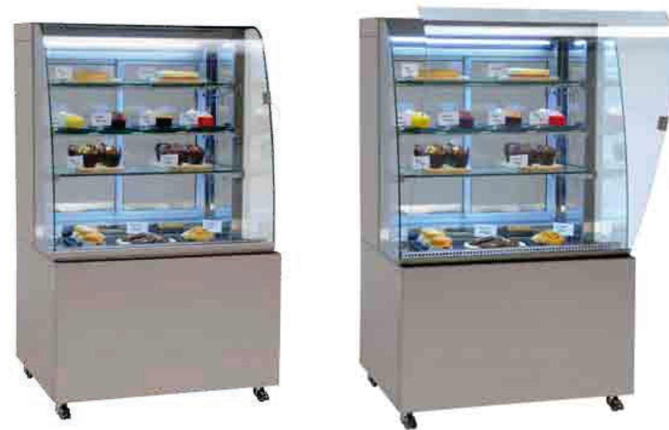
Above: The Gem Pastry Chiller maximizes the display area while keeping footprint to a minimum. Left: The Gem Sandwich Chiller features an innovative new air curtain system which recycles the cold air - cooling the refrigeration system and reducing energy consumption.