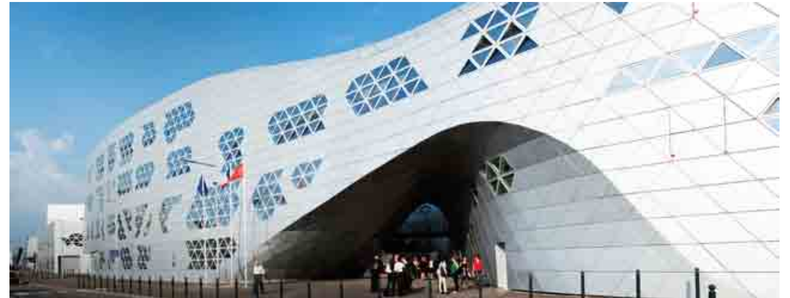
The futuristic project for the Lycée Georges Frêche was designed by Massimiliano Fuksas.