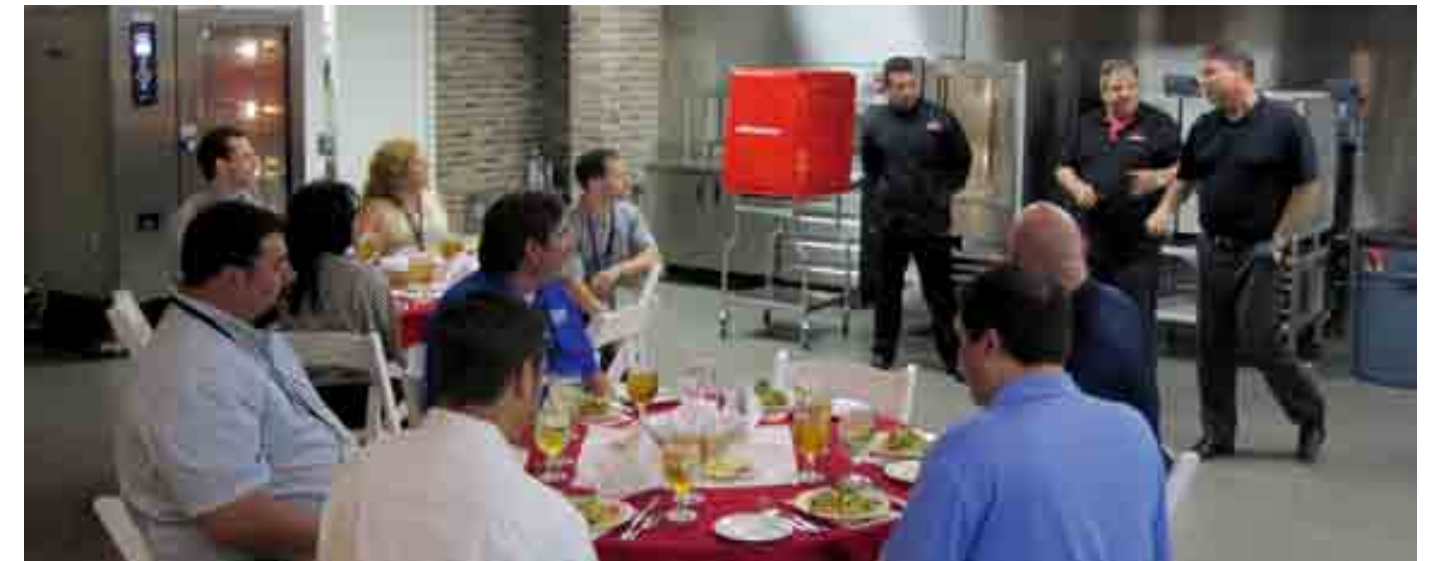
Eloma workshop at the new Ali North American training center.