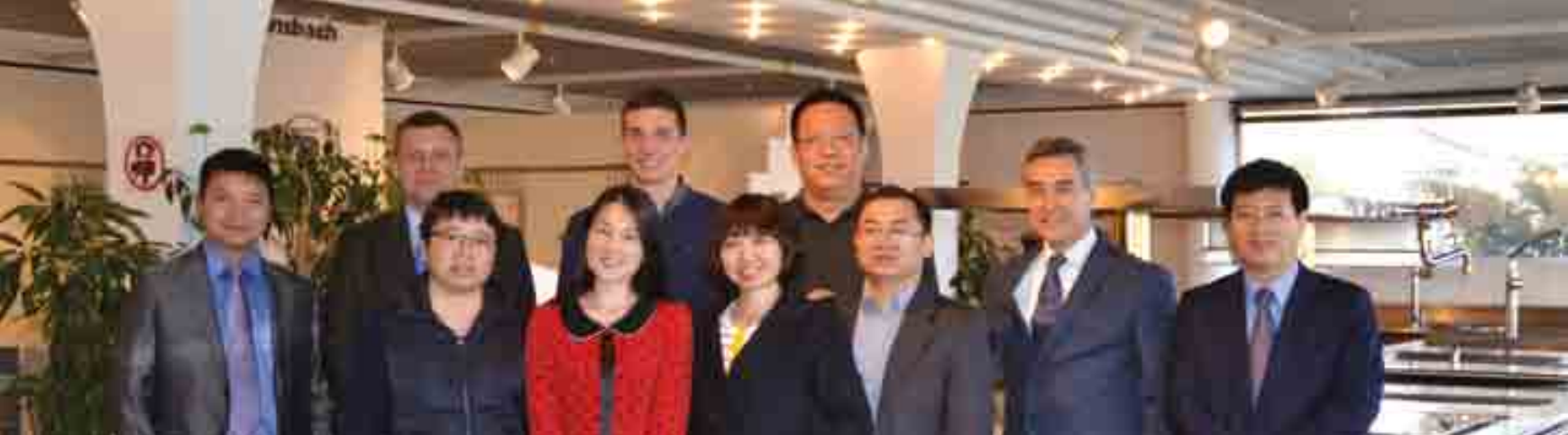
The Ali China team at work with product trainings, with clients and at the booth at Hotelex, Shanghai 2013.