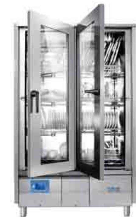
The Twin Star Double Side Dishwasher provides all the benefits of a tunnel system combined with those of cycle machines.

With these savings, the machine can be amortized in less than 1 year (with average use and costs E.U.)