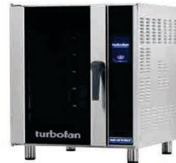
Turbofan convection ovens offer an expanded platform of products.