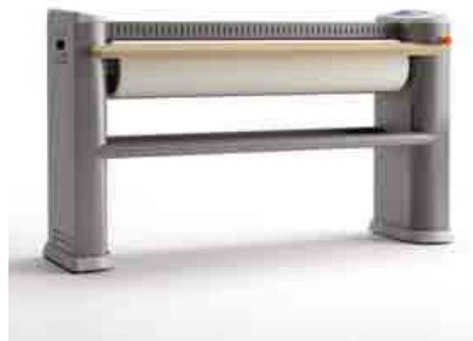
The new roller ironer GI: ergonomics and efficiency assured.

The capacity of the dryers has been increased so that it is possible to dry an entire load of the corresponding washing machine in only one cycle. The metal filter is slanted so that cleaning does not have to be done as