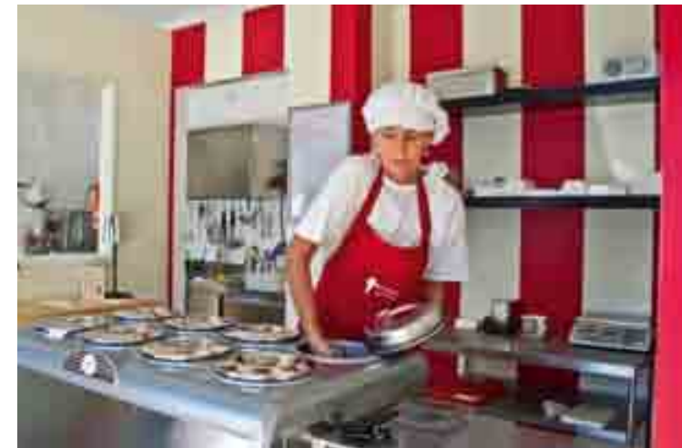
Mami Gelato al Volo any time, anywhere.