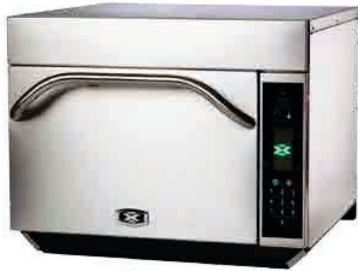
The 2200 W MXP22 can cook 28 baked potatoes in just under one hour!

Great MXP design features make the oven easy to add to any foodservice operation. Ventless installation means no costly hood or increased HVAC and the reduced footprint and stackability means that there is always a place in your kitchen for an MXP. The compact, elegant exterior belies a capacious interior, which accepts a 14" pizza.