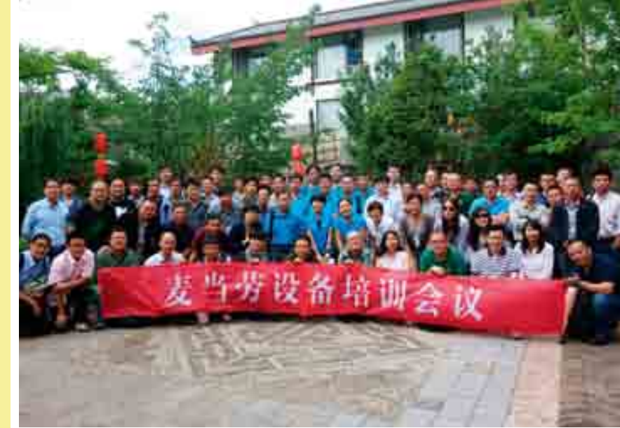
Product training for McDonald's employees.