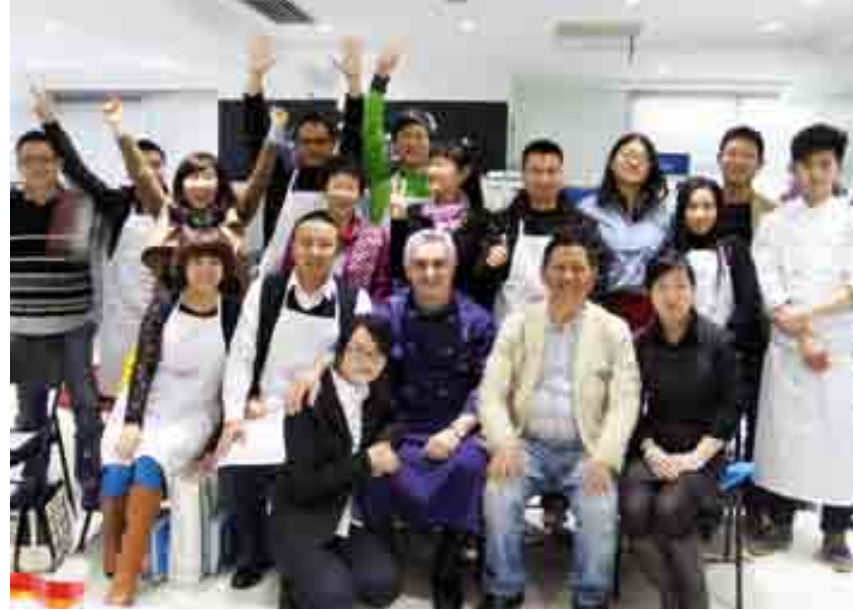
Gelato University: all together for the class photo.