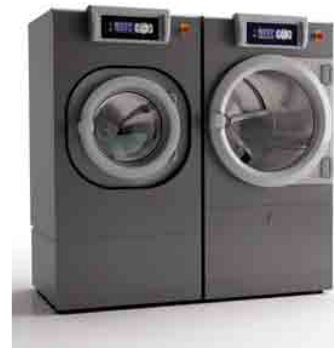
The innovative washing machine GH and the advanced dryer GD. The dryer was recognized with the prestigious Red Dot Design Award 2013.