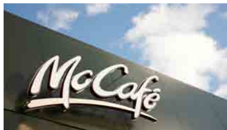
Moffat was selected to develop a customized convection oven for baking McCafés patisserie products.

“This exciting project demonstrates Moffat's collaborative approach, its ongoing investment in research and development, and its preparedness to develop new solutions in order to meet clients' individual needs”