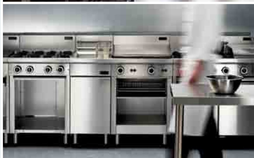
Innovative product solutions released during 2013.