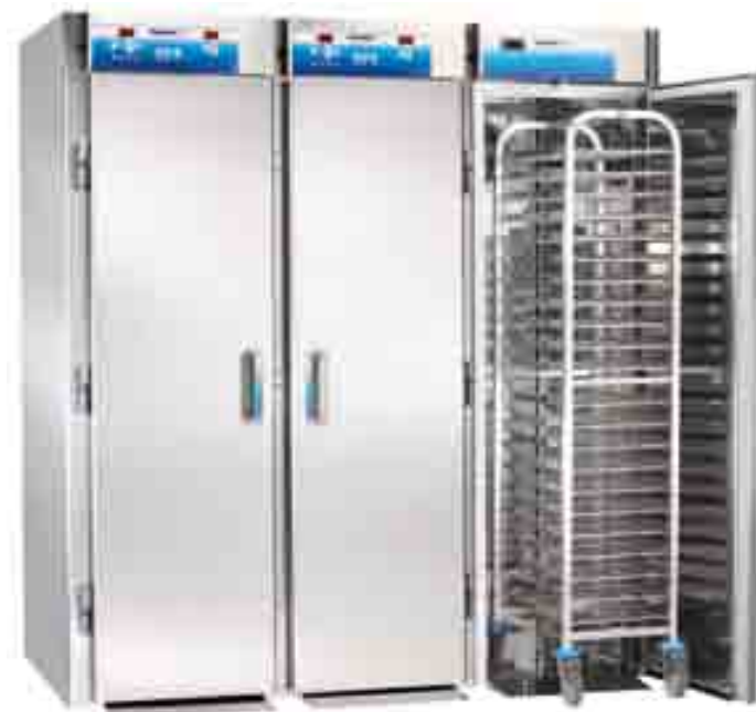
The Roll-in Blast Chillers have a patented i-Chilling electronic control with self-adapting chilling to cool foods evenly and thoroughly. The ergonomics assure easy operator use and a buzzer will remind you when the cycle is complete.