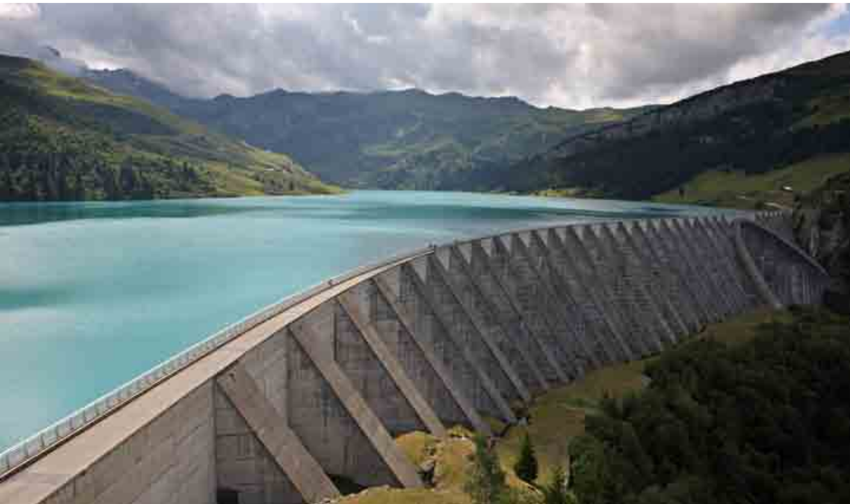
A large dam is a complex project which takes many years of work.