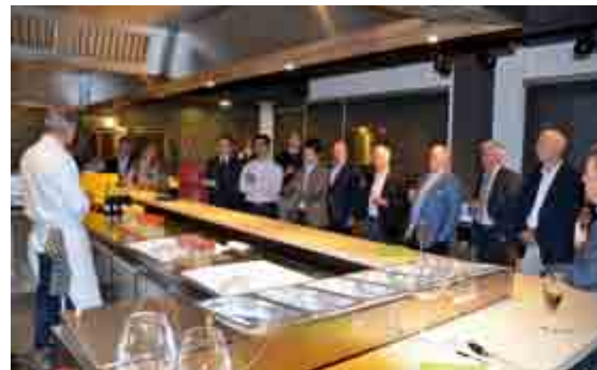
Training courses by Williams, Lainox and Metos Holland.