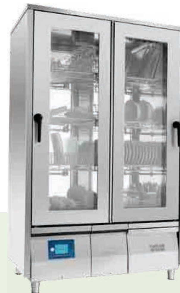
The Twin Star Double Side Dishwasher saves space and time. Load dirty dishes in one area and unload the clean dishes, ready for use, in another.