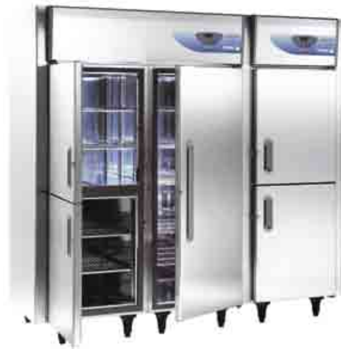
The Fristyle Plus Cabinet Series , designed to perform in environments with elevated temperatures, are equipped with a unique refrigeration system of fan-driven cold air that assures a homogeneous temperature for all products.