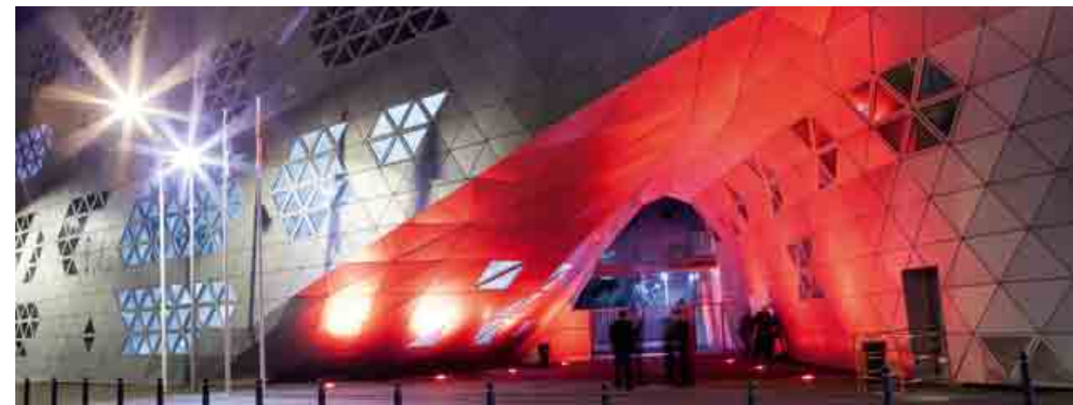
Left: the sign at the entrance to the restaurant. Above: a classroom, the pastry lab and the building at night.