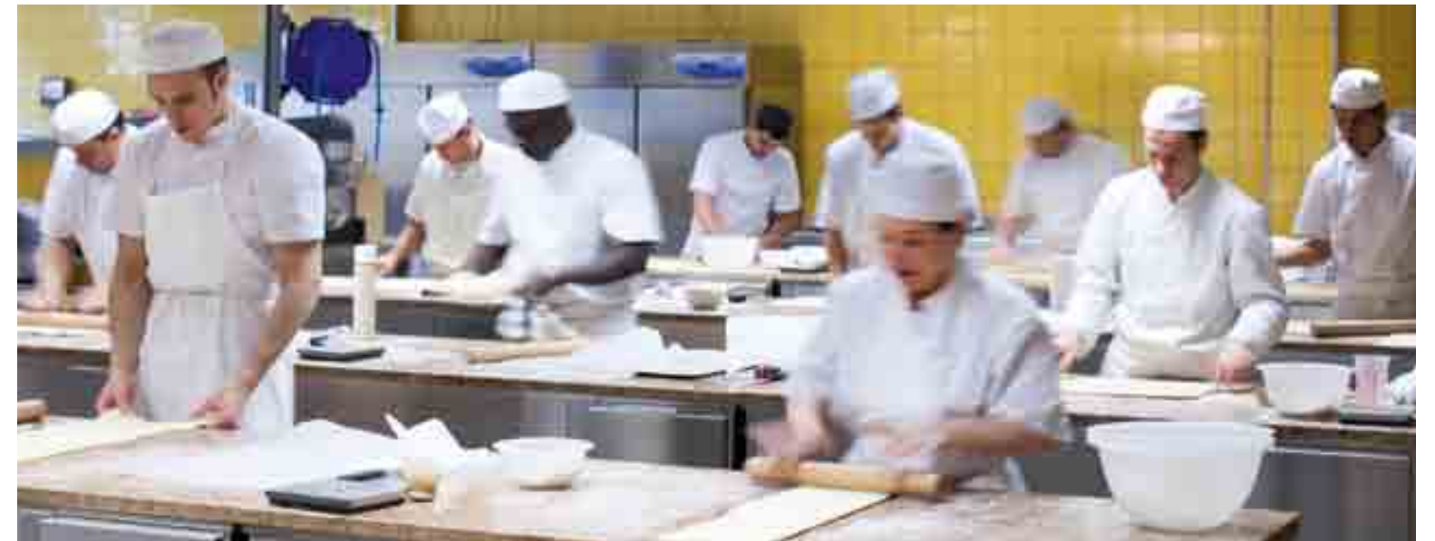
Learning how to make handmade pasta.