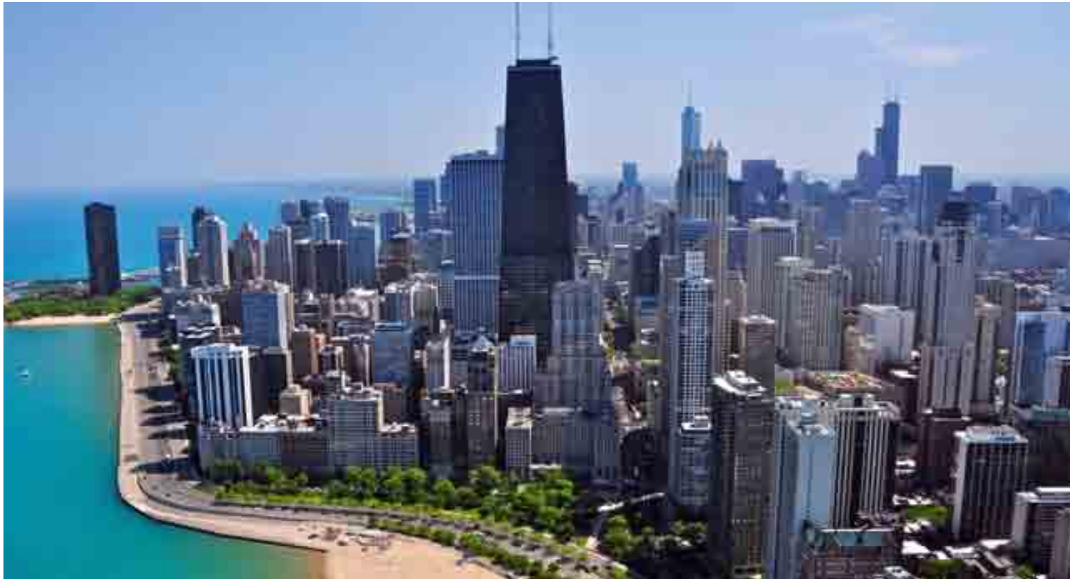
The skyline of Chicago, the Windy City.