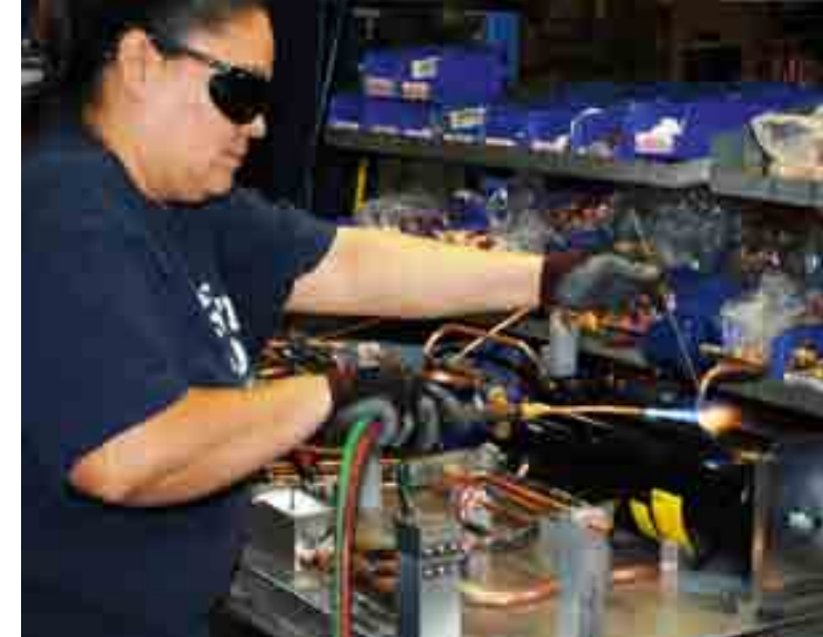
Brazing a joint at the Ice-O-Matic factory in Denver, Colorado.

Some markets traditionally use more ice, such as the Americas, whereas in Europe ice is less used. Aside from preferences for cube