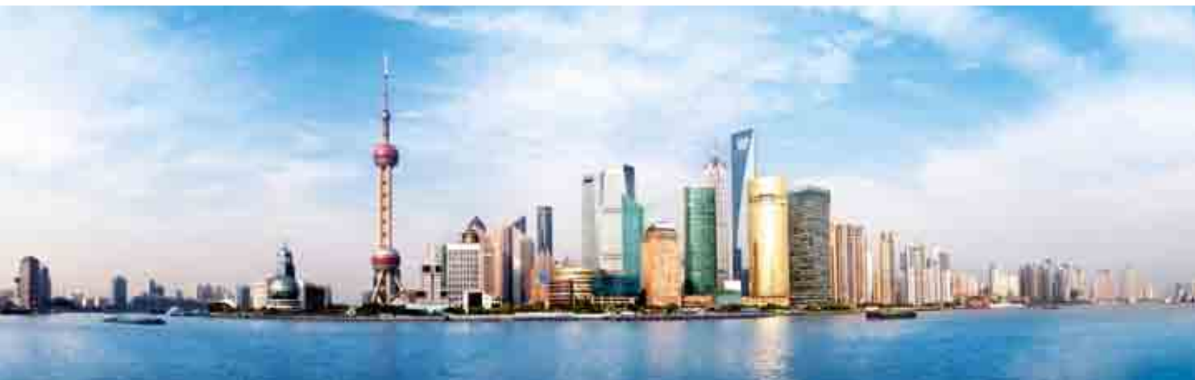
Top: The Great Wall of China is one of the seven wonders of the world. Bottom: The futuristic skyline of Shanghai, the most densely populated city in the world.

WAKE UP AND GET INTO CHINA. How to benefit from the growing Chinese economy.