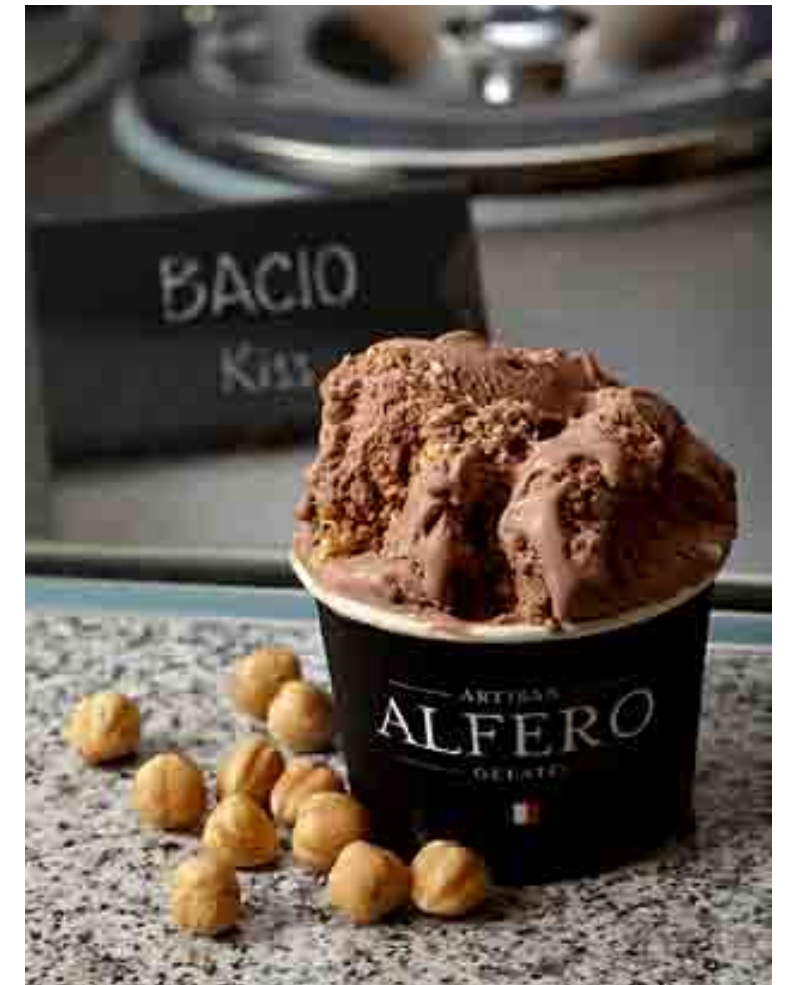
In Singapore you can enjoy Alfero gelato while taking a walk, or sitting comfortably at the gelateria.

I now have 3 gelaterie in Singapore and over the next couple of years I am looking to expand in Indonesia, Malaysia and possibly even China. There are endless opportunities for a high quality product. Carpigiani is the perfect partner to guarantee quality and service, no matter how large or small your business is.