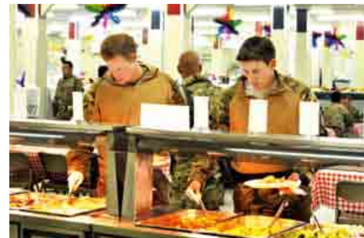
HRH Prince Harry in the officers' mess at Camp Bastion in Afghanistan.

Every project is a completely different challenge. It is never repetitive : the clients are unique, the menu for a UN group is different than a menu for miners and the environmental conditions are extremely varied.