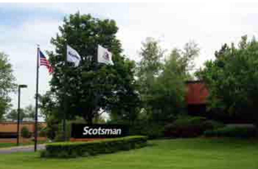
The Scotsman Industries headquarters in Vernon Hills, Illinois.

WHEREVER ICE IS NEEDED, SCOTSMAN INDUSTRIES IS THERE.