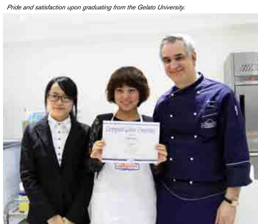
Pride and satisfaction upon graduating from the Gelato University.