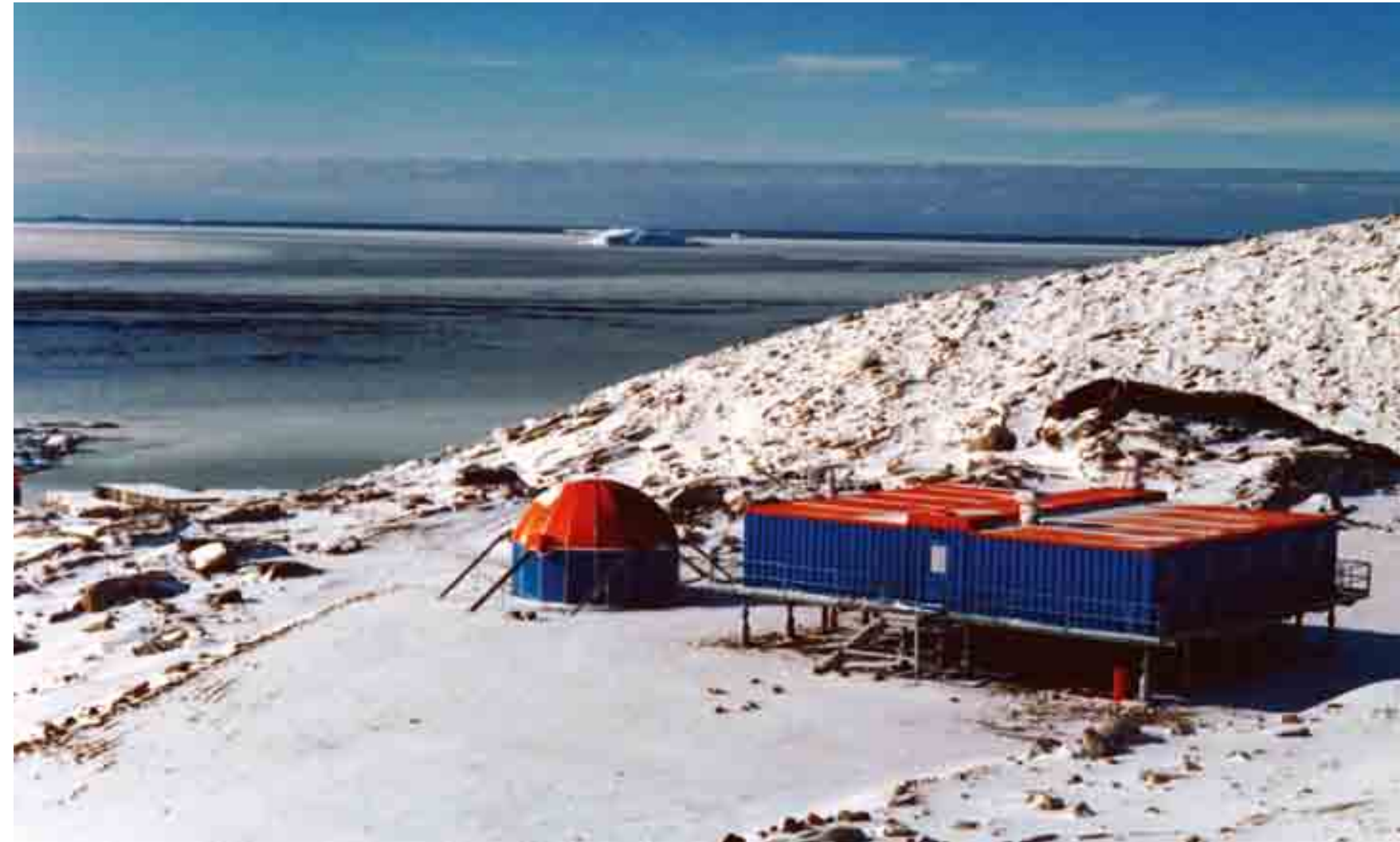
The kitchens and laundry facilities equipped by Alicontract in the prefabricated units built by Franzisella at the South Pole.

Alicontract provided the kitchens and laundry facilities for the Sahara desert base camp of AL.MA Group, one of the most important caterers worldwide. The camp hosted over 6.000 people.