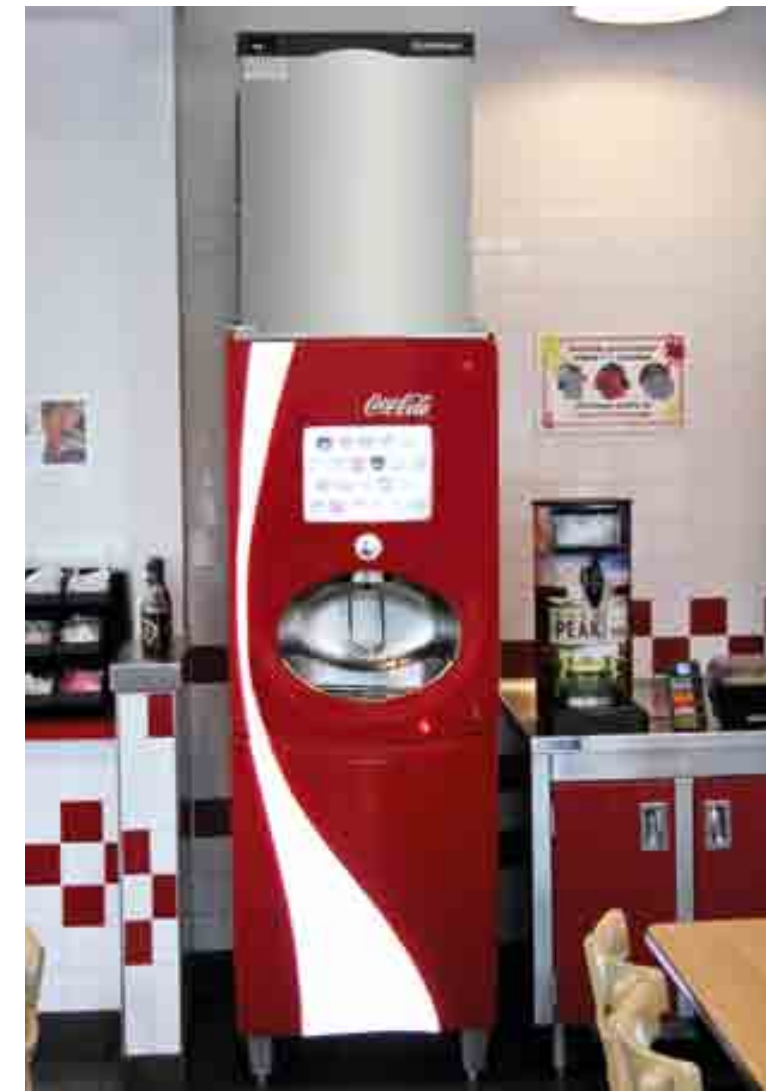
Scotsman C0722 cuber designed for the Coke Freestyle Machine. It is installed in a Five Guys Burgers and Fries restaurant.

To complete the offering, Scotsman Industries surrounds all of this with extremely high levels of customer service before, during and after the sale. Technical assistance is provided by over 5,000