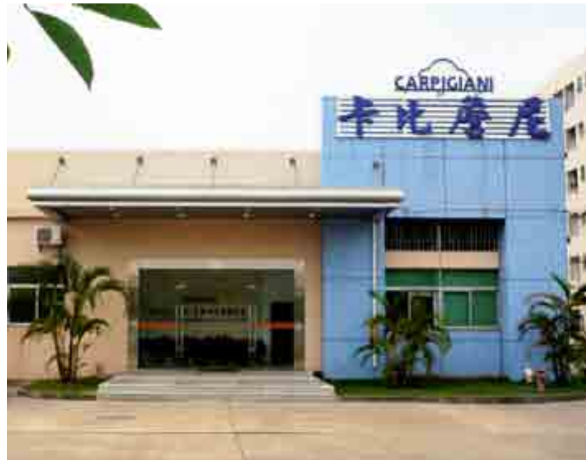
Office and manufacturing site in Guangdong.