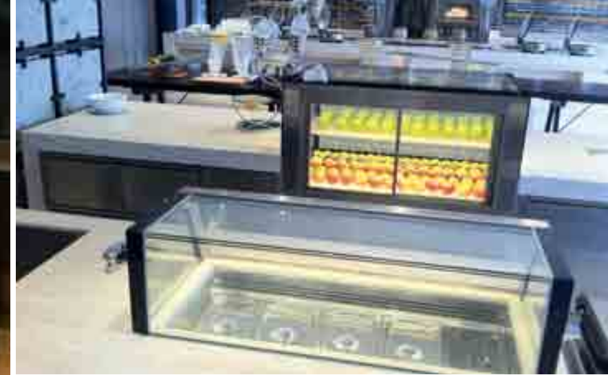
Images show a selection of applications such as Wine, Chocolate, Cake and Sushi display. Features such as hidden controllers, invisible handles and V-cut bending help to give the range a sleek and stylish finish.