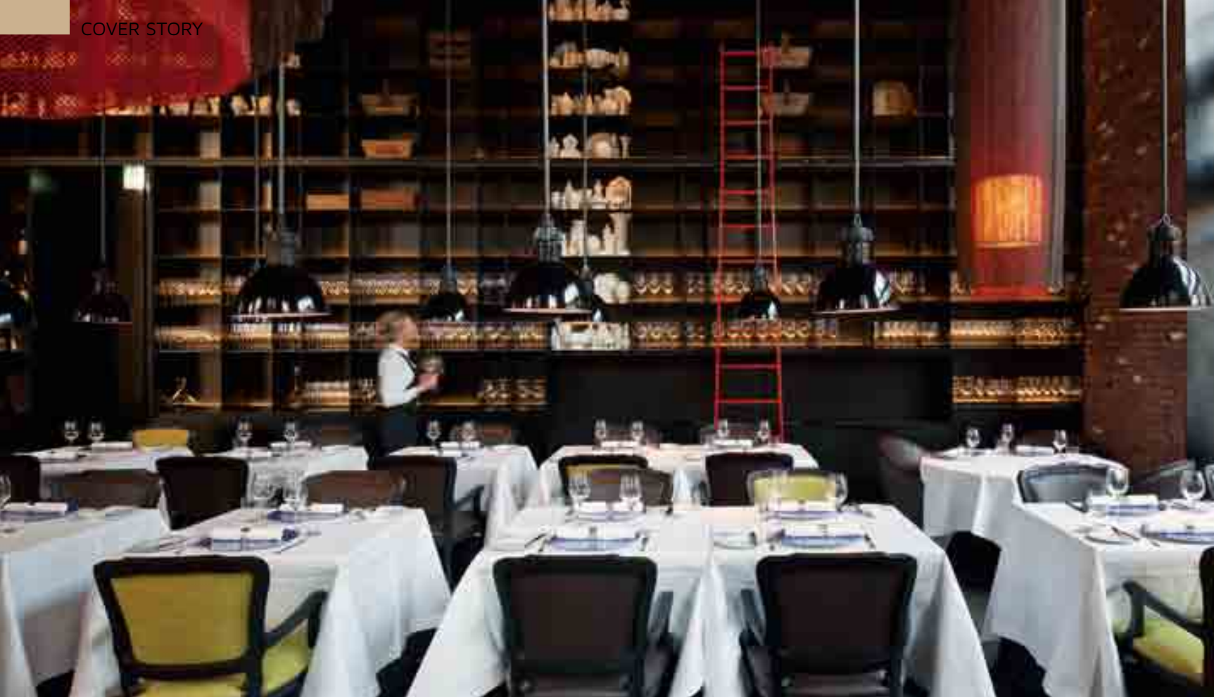
Tunes Restaurant has a truly cosmopolitan feel and is becoming one of Amsterdam's leading restaurants. The iron staircase provides a strong, sculptural impact and creates a link between the old and new buildings.