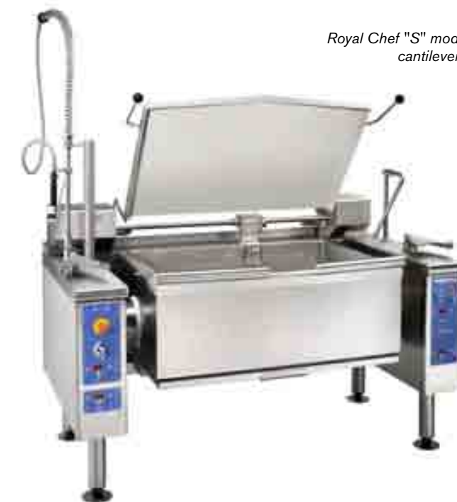
Royal Chef "S" modular island cantilevered system