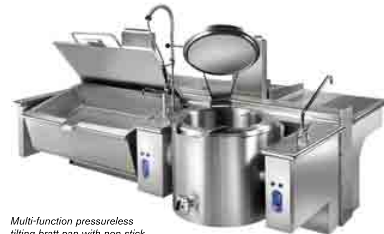
Multi-function pressureless tilting bratt pan with non stick mixing device (Rosinox patent)