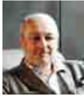
Interview with Piero Lissoni, architect and interior designer of Conservatorium Hotel Amsterdam