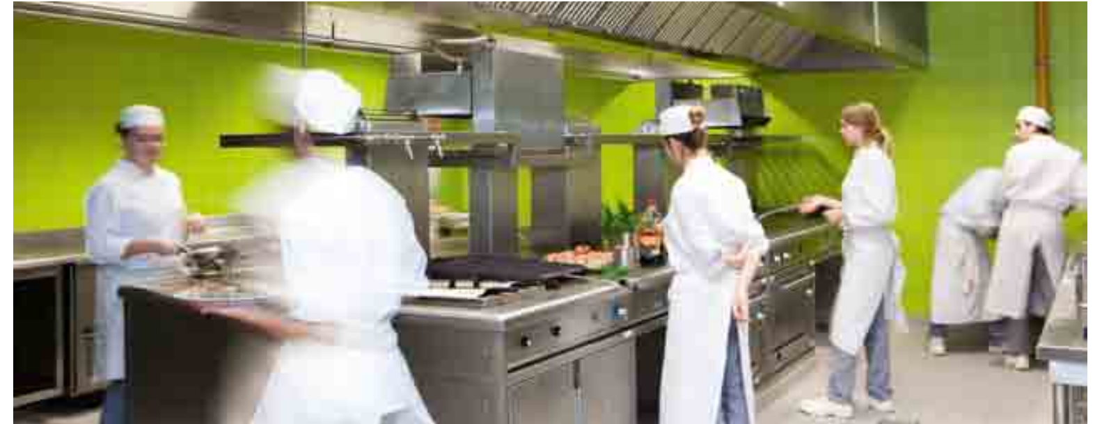
Students working in the kitchens at Lycée Georges Frêche.