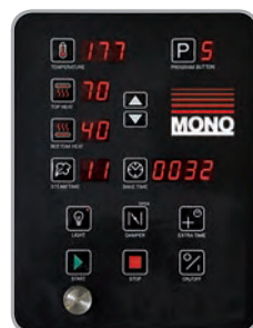
The Classic Controller