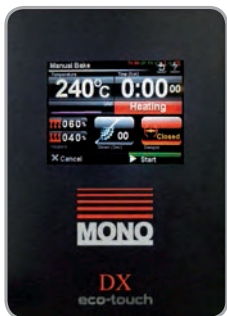
The Eco-Touch Controller