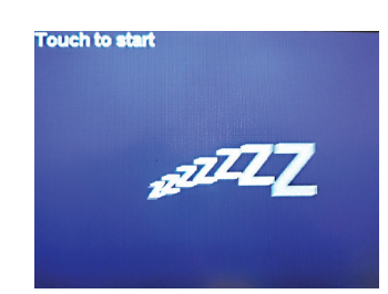
Putting the oven into sleep mode between bakes help save energy.