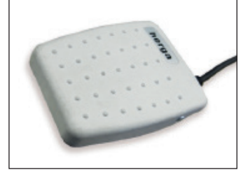
Activating Foot Pedal Used instead of the Activating Tray for easier switch control. Code: B842-07-039