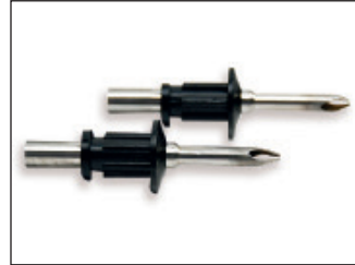
Standard Needles Standard and elongated needles available. Code: 053-03-03900 (8mm diam) Code: 053-03-04700 (114mm diam)