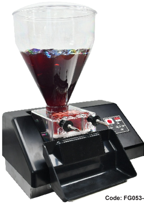
Code: FG053-A21 (base unit)