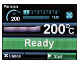
When the oven reaches the correct temperature the ready screen will show.