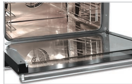
Twin pane vented glass reduces external door temperature