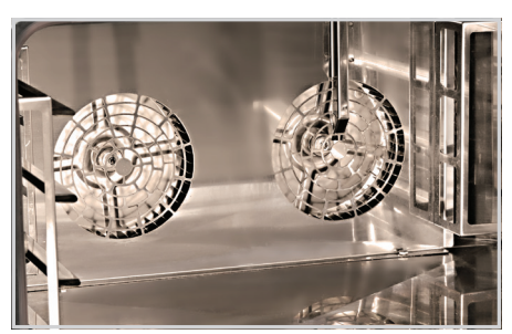
Twin bi-directional fan system for enhanced performance