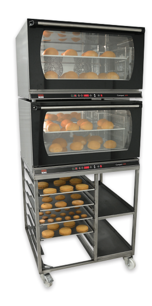
Optional Extras and Configurations Racked Base Unit for Compact 643 and Compact 644

Please contact MONO Equipment for USA electrical details.