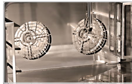
Twin bi-directional fan system for enhanced performance