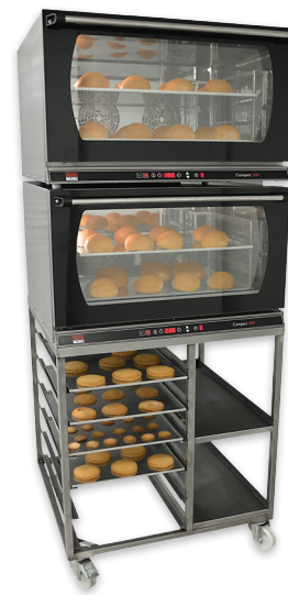
Optional Extras and Configurations Racked Base Unit for Compact 643 and Compact 644

Please contact MONO Equipment for USA electrical details.