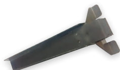
Doughnut Tray Handles