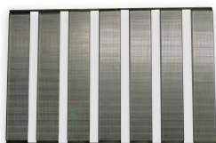
Aztec Doughnut Fryer Tray