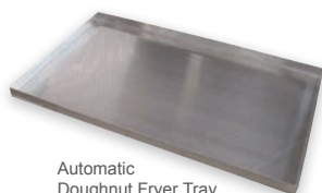
Automatic Doughnut Fryer Tray