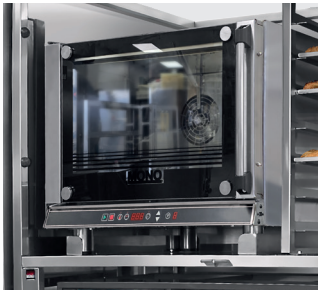
MONO 3-Tray Convection Oven