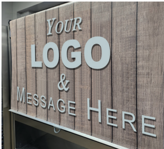
Heat Resistant Blind