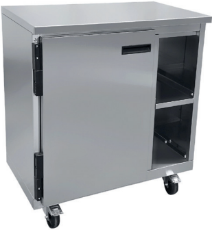
Racked Preparation Trolley