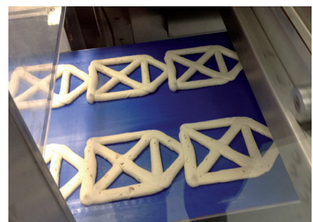
Complex Shapes and Designs