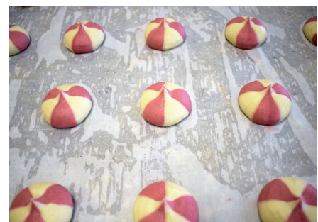
2 Colour Segmented Drops