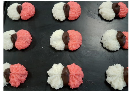
3 Colour Coconut Drops