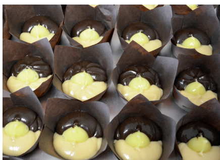
3 Colour Cupcakes

The Ultimate Depositor - Creates Complex Shapes with upto 3 Different Colour Mixes