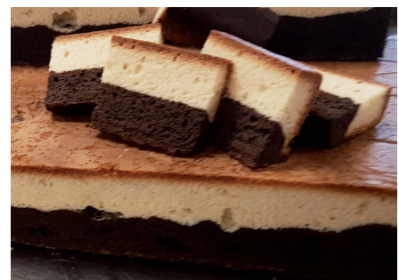
2 Coloured Layer Cake in 1 Pass