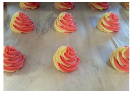
2 Colour Rose with Twist