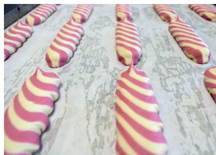
2 Colour Eclair with Twist