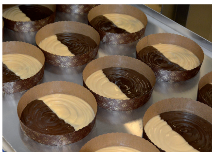
2 Coloured Sponge Cakes Half-and-Half