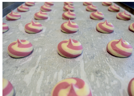
2 Colour Drops with Twist