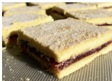
3 Layered Sheetings in 1 Pass