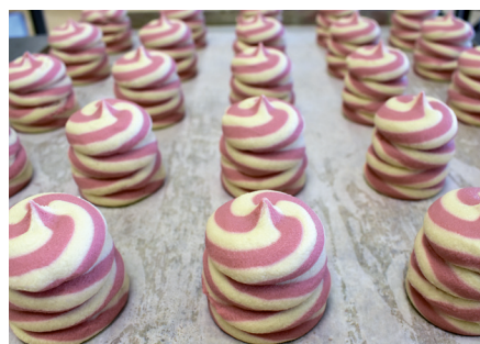
2 Colour Multiple Drops with Alternate Twists