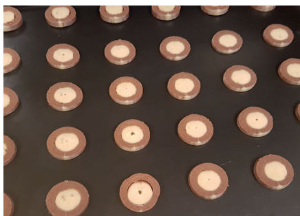
2 Colour Wirecut Biscuits