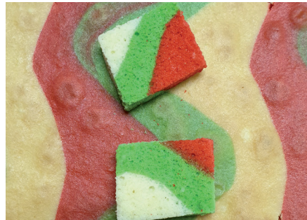
Multi Coloured Random Cake deposits