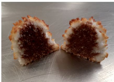
2 Colour Coconut Macaron