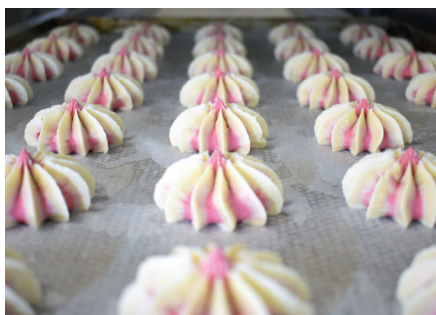
2 Colour Star Flower Drop