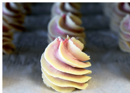
2 Colour Tower with Twist