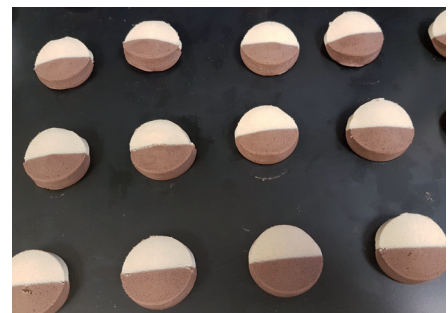
2 Colour Half-and-Half Biscuits