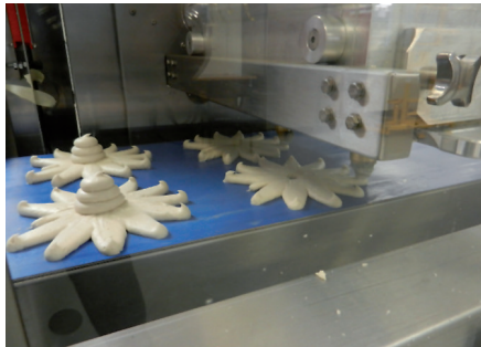
Complex Shapes and Designs