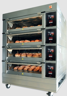
MONO Harmony DX Eco-Touch Deck Oven