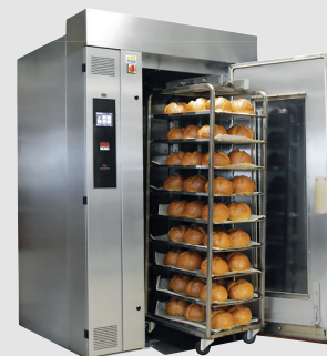
MONO MX Eco-Touch Rack Oven

MONO manufacture ovens that independent bakers, foodservice outlets and large supermarket chains have been relying on for over 70 years. Contact our sales team today for Deck & Rack ovens that won't let you, or your business down.