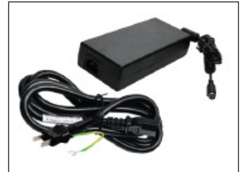
Japanese Power Supply Lead Code: B842-06-040 + Code: B790-93-001 (PSE)