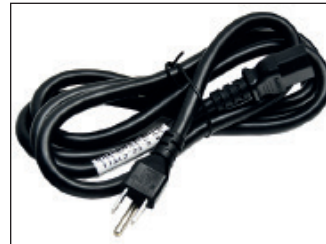
American Power Supply Lead Code: B842-06-039