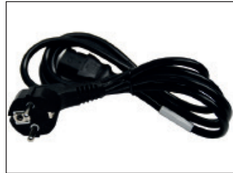
European Power Supply Lead Code: B842-06-038