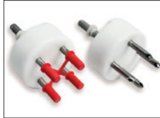
4-Prong Needles Specially designed for injecting ring doughnuts in 4 places. Code: 053-03-04000 (needles) Code: 053-03-05000 (red caps)