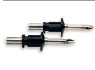
Standard Needles Standard and elongated needles available. Code: 053-03-03900 (8mm diam) Code: 053-03-03904 (10mm diam) Code: 053-03-04700 (14mm diam)