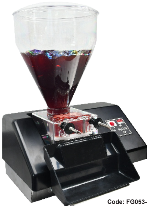
Code: FG053-A21 (base unit)