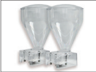
Hoppers Ideal for holding different fillings for quick change over. Code: 053-02-00000