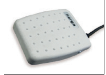
Activating Foot Pedal Used instead of the Activating Tray for easier switch control. Code: M053-KEA004