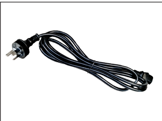
Australian Supply Lead Code: B842-06-041