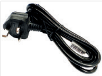
British Power Supply Lead Code: B842-06-037