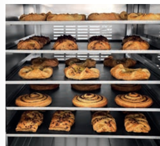
Integrated Storage Rack