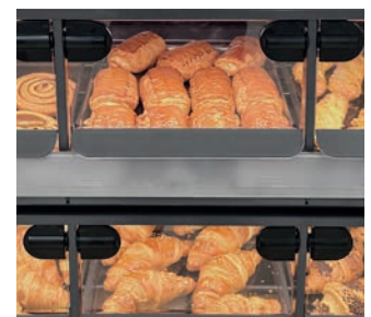
6 Product Cassettes