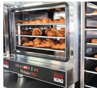
MONO Minibake Pro Convection Oven