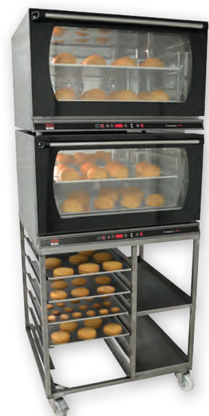
Racked Base Unit for Compact 643 and Compact 644