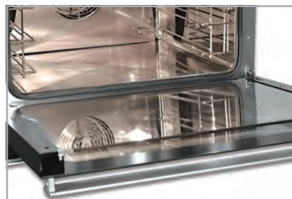
Twin pane vented glass reduces external door temperature

Each oven features a twin-pane glass door which offers excellent visibility without compromising on heat retention and the internal oven light perfectly illuminates the product, providing the baker with excellent visibility of the baking progress.