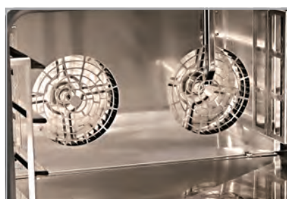
Twin bi-directional fan system for enhanced performance

The oven chamber of the 4-tray compact convection oven features an integrated halogen light which provides the user with excellent visibility of the products.