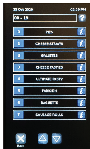
Able to store up to 240 unique baking programmes.