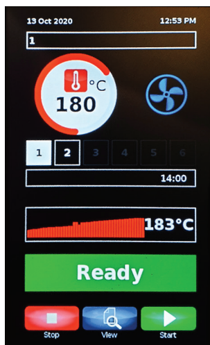
When the oven is at the desired temperature the ready screen will be displayed.