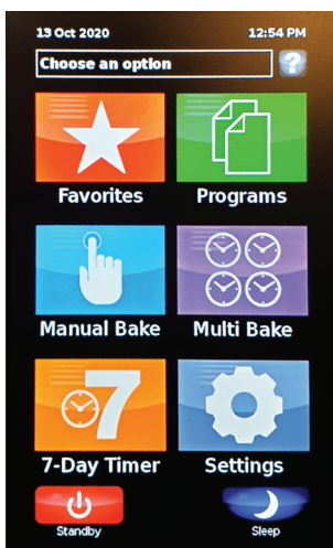
High definition touch-screen controller.