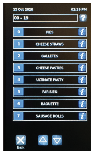
Able to store up to 240 unique baking programmes.