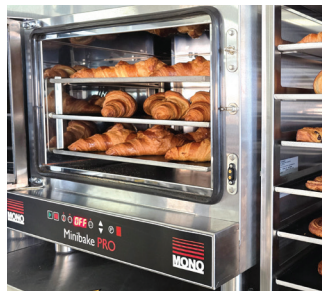
MONO Minibake Pro Convection Oven