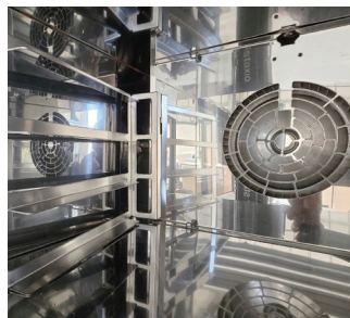
Fan and tray runners