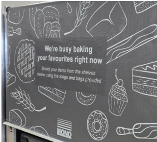
Heat Resistant Blind