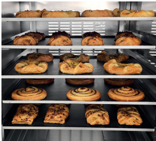
Integrated Storage Rack