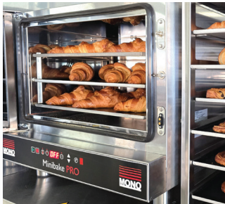
MONO Minibake Pro Convection Oven