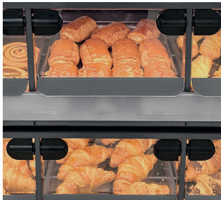
6 Product Cassettes