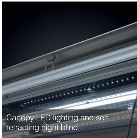
Canopy LED lighting and self retracting night blind