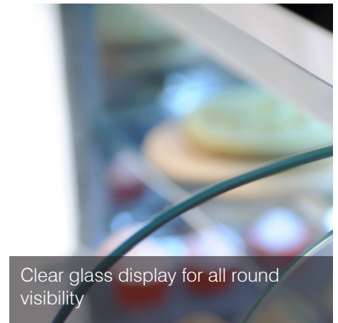
Clear glass display for all round visibility