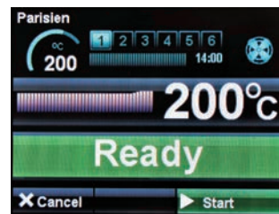
When the oven reaches the correct temperature the ready screen will show.