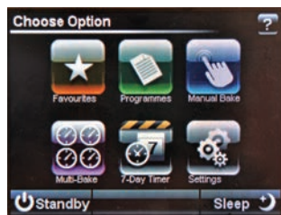
User-friendly color touch controller.