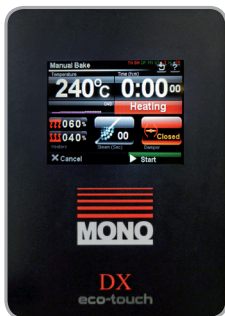
The Eco-Touch Controller