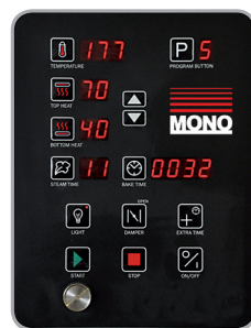
The Classic Controller