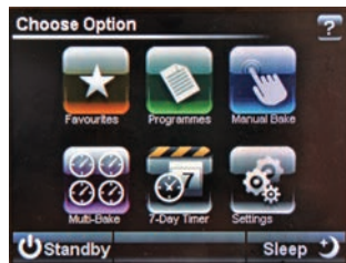
User-friendly color touch controller.