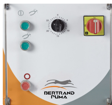
Manual control (EM)